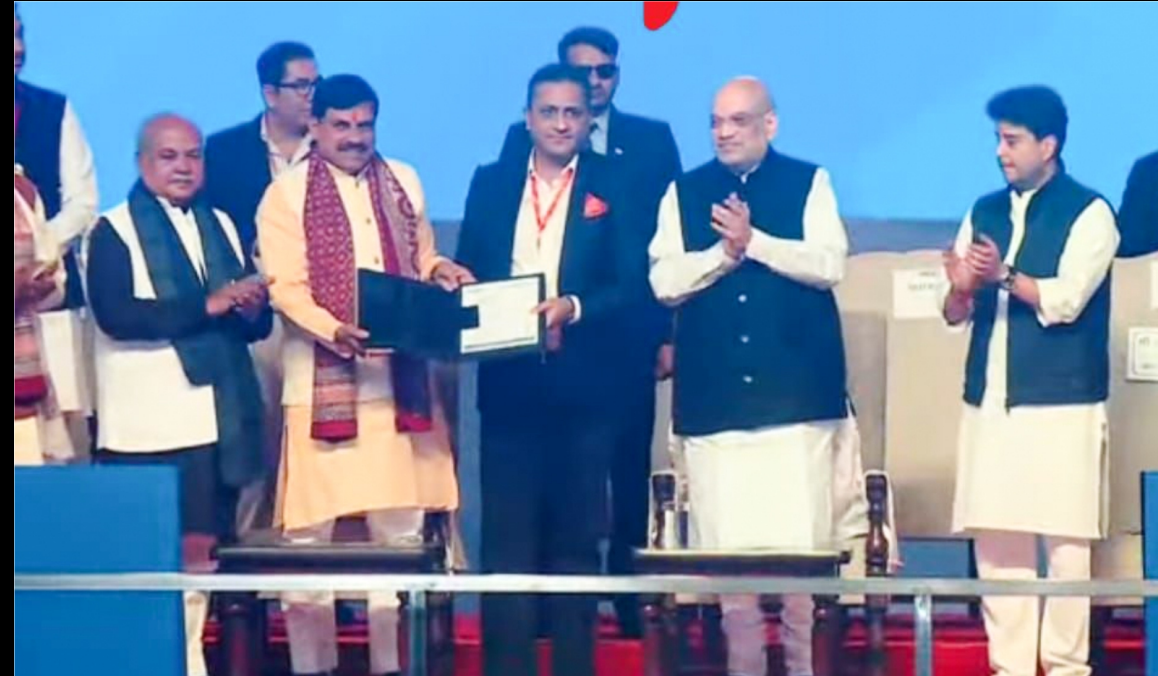
RSWM Participates in the MP Global Investors Summit: A State Platform for Industry and Investment Engagement