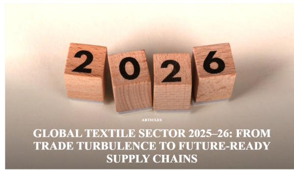
GLOBAL TEXTILE SECTOR 2025-26: FROM TRADE TURBULENCE TO FUTURE-READY SUPPLY CHAINS